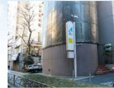
Exterior of the building