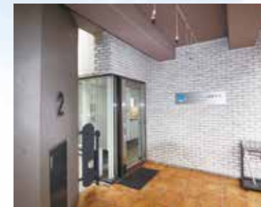
School 2F Entrance