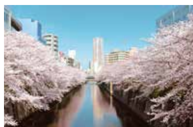
Cherry blossoms on the Meguro River

There are also many restaurants and convenient convenience stores.