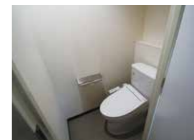
Toilet with washlet