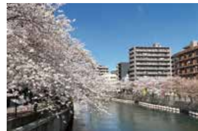
Ooka River Cherry Blossoms

Near Koganecho Station is the Ooka River, which is a famous cherry blossom viewing spot. It is close to Yokohama Station and Kannai Station, and has good access to Tokyo. There are public institutions such as government offices around Kannai Station, and there are many parks around Yokohama Port, making it an environment where you can feel nature even though you are in the city.