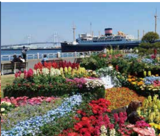
Yokohama Port/Yamashita Park