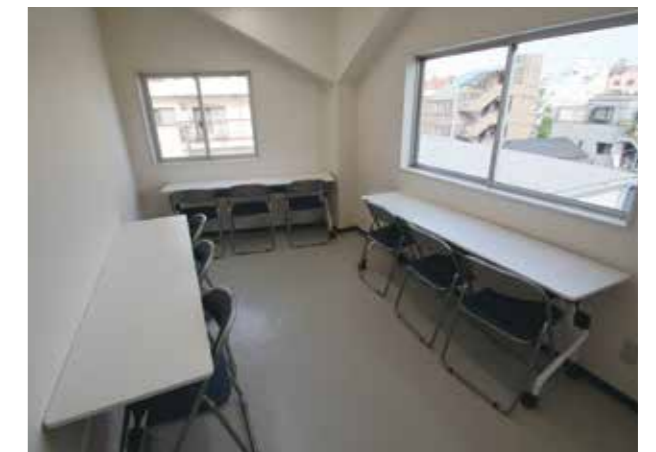
3F multipurpose space