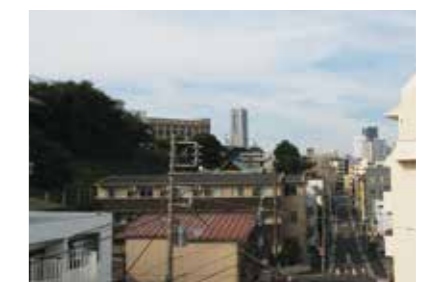
Landmarks visible from the window